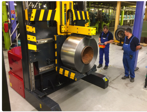
COIL CAR TRANSPORTER