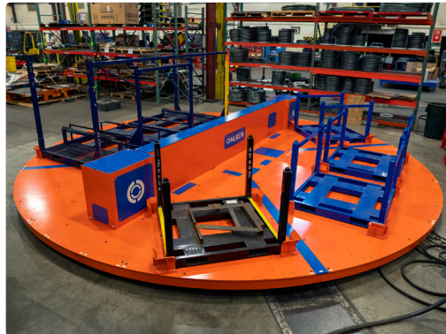
HIGH SPEED AIR CASTER TURNTABLE