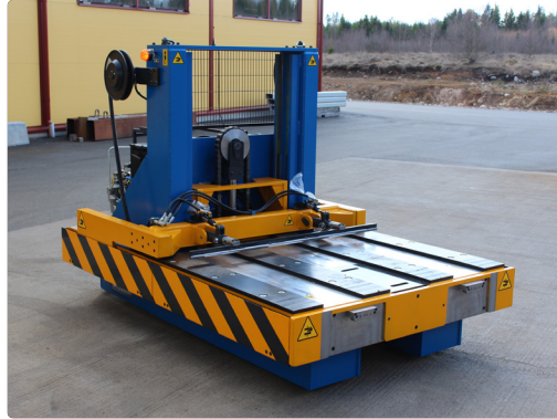
MOLD AND DIE TRANSPORTER