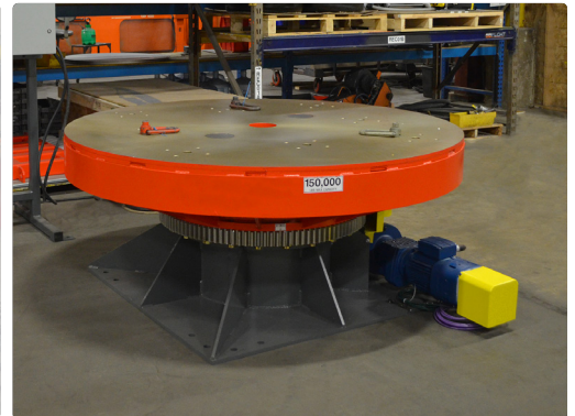
HEAVY DUTY MECHANICAL TURNTABLE